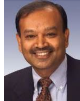
Meyya Meyyappan, Nanotechnology Council Rep