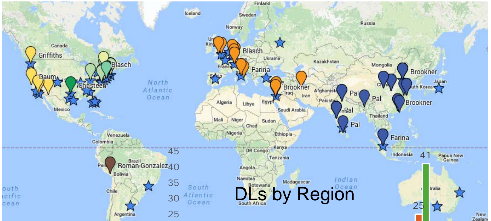
DLs by Region