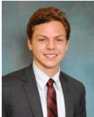
Undergraduate Student Representative