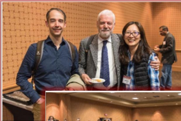
YP event @ 2018 IEEE Radar Conference

Organize local activities dedicated to students