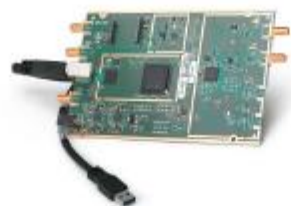
Figure 2 – The USRP B200 radio used to generate and send the RF signal to the rest of our device.