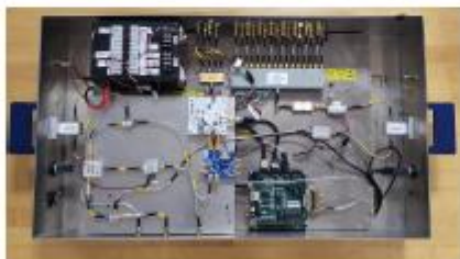
Figure 3 – Inside view of the electronics box with the new plate of components.