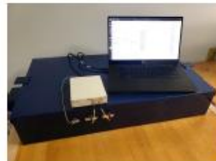
Figure 4 – The software radio connected to the updated electronics box.