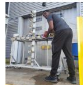
Figure 5 – Calibrating the SDR-SAR before a data collection. This data is then processed through MATLAB for the final imaging results.

As of today, the team successfully completed the main objectives of our three phase plan. Some major goals that were accomplished include: