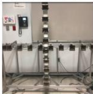
Figure 1 – The SAR, which will be used to beam the output of our electronics box to the environment.

This ongoing project, sponsored by Northrop Grumman, had some issues in the past where the RF signal generated would leak between horns on the aperture, producing noise that would hinder accurate detection of objects. Using a software radio instead of a hardware-only platform, our team has the capability of removing that noise using software-based filtering techniques.