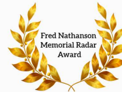
Fred Nathanson Memorial Radar Award

To recognize a radar engineer for outstanding achievements due to a major technical advance (or series of advances) in the art of radar engineering.