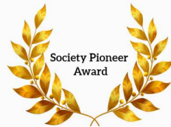
Society Pioneer Award

An annual AESS award to recognize candidates that have provided outstanding contributions to space engineering in the AESS Fields of Interest.