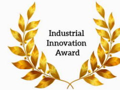
Industrial Innovation Award

Calls for Nominations: sent on 18 Sept. 2019.