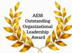
AESS Outstanding Organizational Leadership Award

Has been given annually since 1949 to an individual or team for "contributions significant to bringing into being systems that are still in existence today."