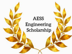
AESS Engineering Scholarship

To recognize candidates that have the unique capability of conceiving and organizing innovative and successful events in the field of interest of the IEEE Aerospace and Electronic Systems Society.