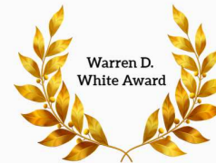
Warren D. White Award