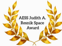
AESS Judith A. Resnik Space Award

An annual AESS award to recognize candidates that have provided outstanding contributions to space engineering in the AESS Fields of Interest.