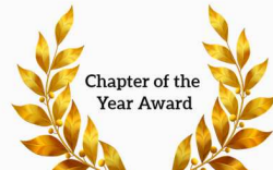
Chapter of the Year Award

This scholarship recognizes students pursuing studies in Electrical Engineering at the undergraduate level, and systems engineering at the graduate level.