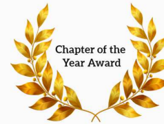
Chapter of the Year Award

To annually recognize the AESS Chapter whose performance is particularly noteworthy during the previous year.