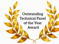
Outstanding Technical Panel of the Year Award

To annually recognize the AESS Chapter whose performance is particularly noteworthy during the previous year.