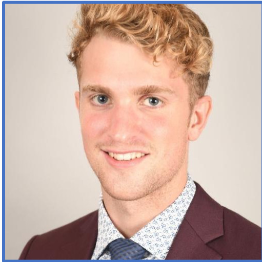
Merék Pipes Union College Region 1, Northeastern U.S.