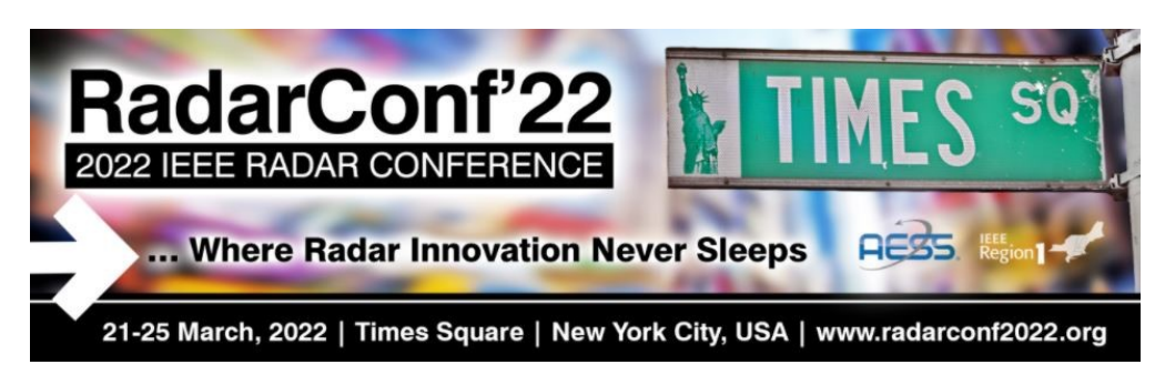
New York City, New York | 21-25 March 2022

The 2022 IEEE Radar Conference will be in Times Square, New York City, USA from 21-25 March: https://www.radarconf2022.org/