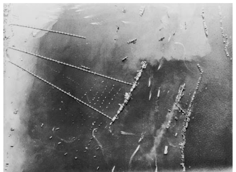
Aerial photograph of the Mulberry Harbour at Arromanches (Sgt. Harrison, No.5 Army Film Photographic Unit, Public Domain).